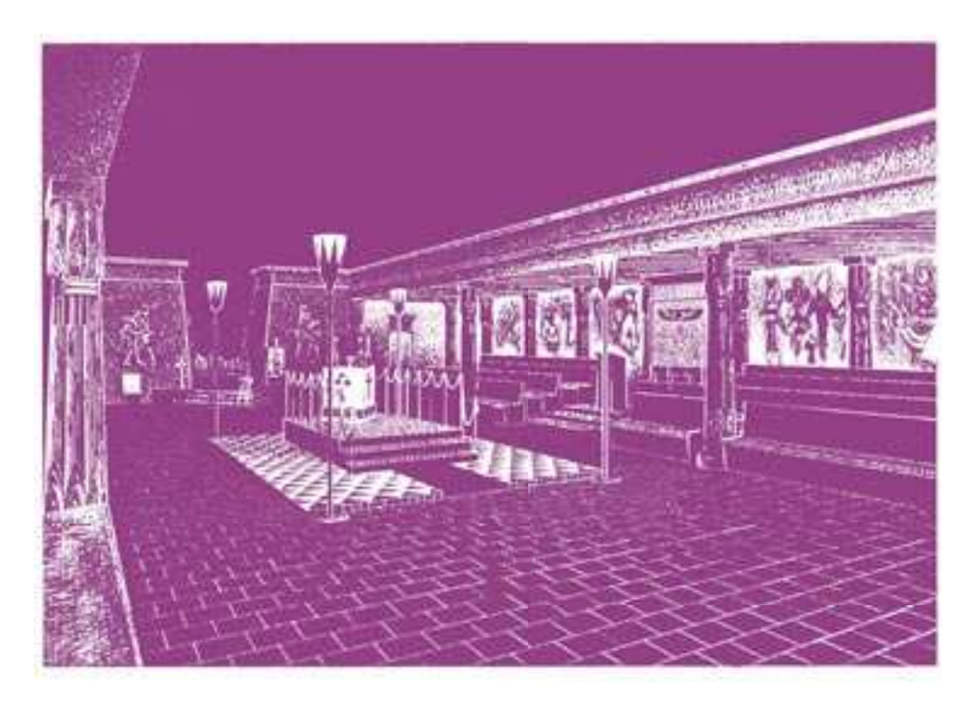
Grand Lodge of the English Language Jurisdiction, AMORC, Inc. Rosicrucian Park, San Jose, California, U.S.A.

This monograph is not subject to sale or purchase by anyone. A sale or purchase may make the seller and purchaser subject to civil liability.